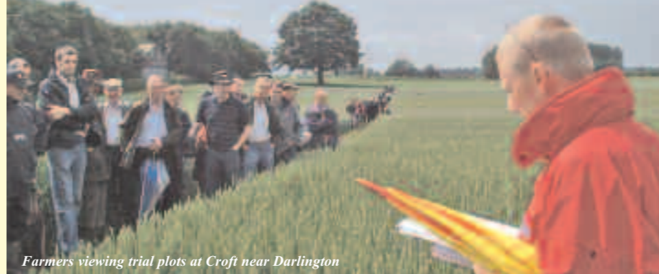
Farmers viewing trial plots at Croft near Darlington