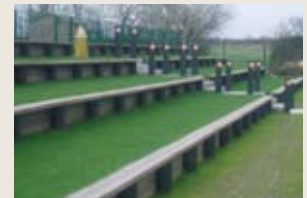
Image for Prendergast School in Haverfordwest which was specified by Pembrokeshire County Council. Using brown sections of 32mm x 150mm, 50mm x 120mm and black 200mm round to make up this outdoor seating area around the sports field. CSR bollards were used as markers between the walkway.